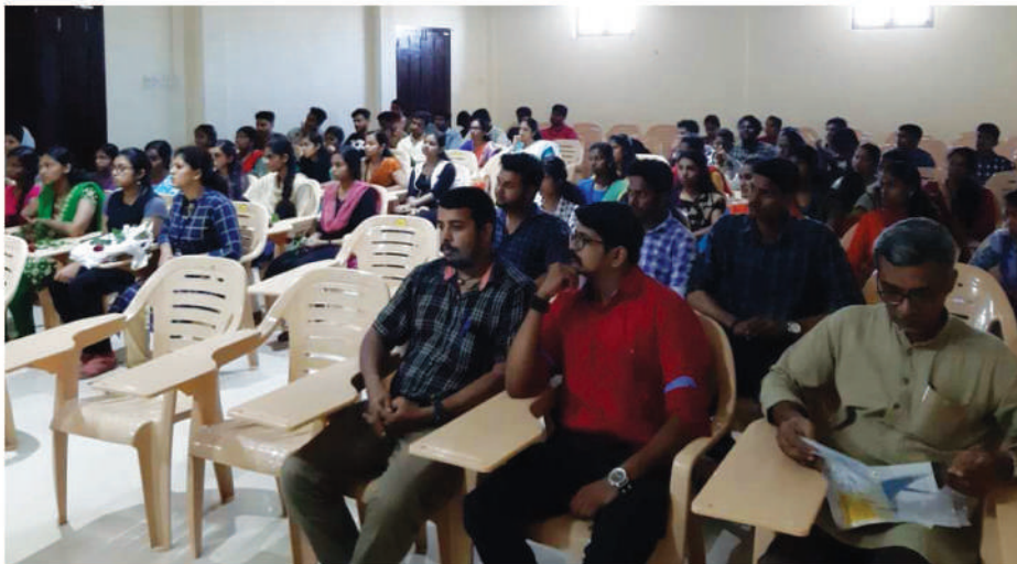
Audience in the inaugural function