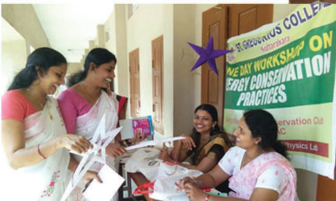
Sale of LED Christmas Stars