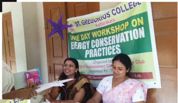
Sale of LED Christmas Stars & bulbs