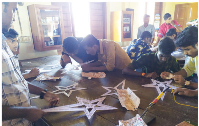
Hands on training on LED star making