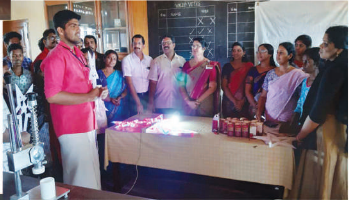
Feed back by students