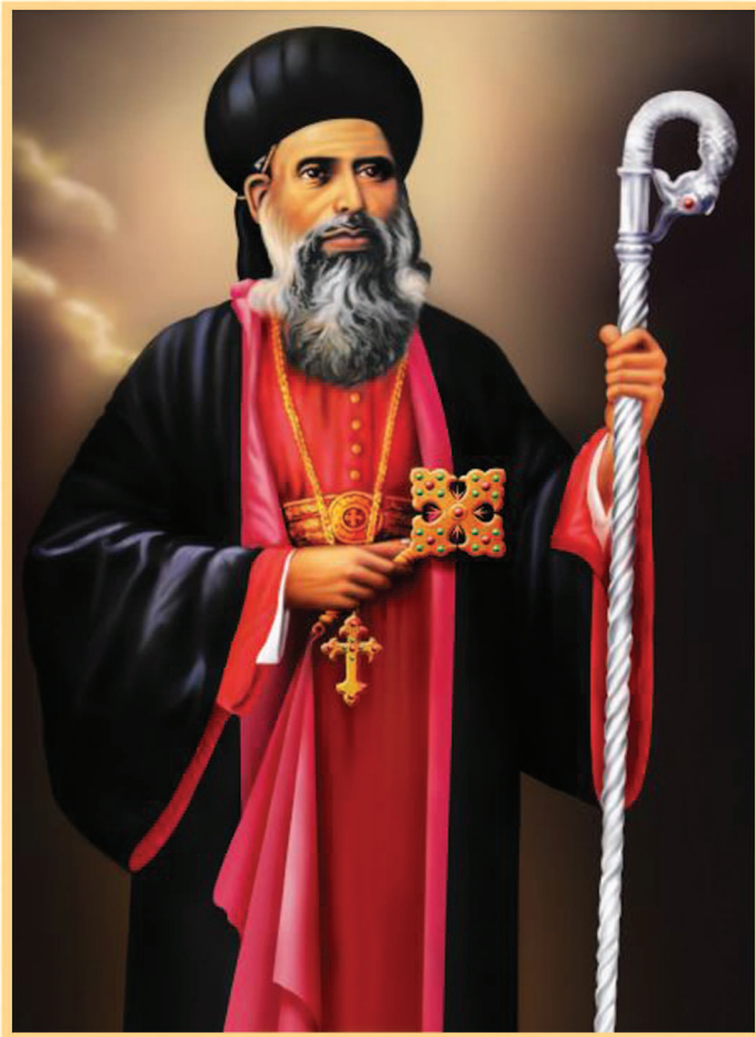
ST. GREGORIOS OF PARUMALA