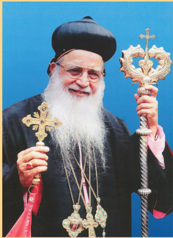
The Late Lamented His Holiness Moran Mar Baselios Marthoma Mathews II