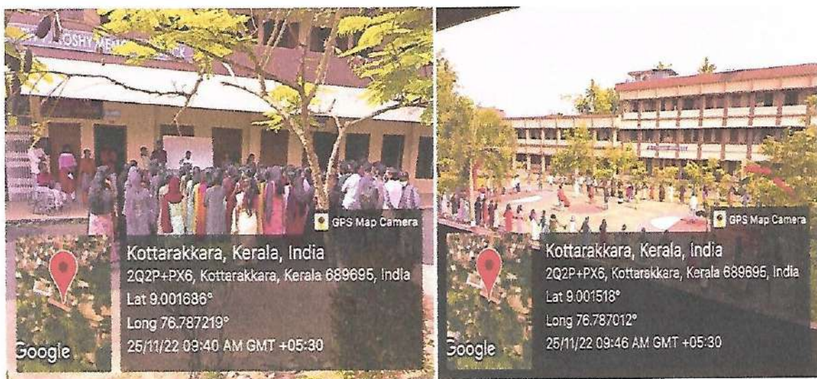
Formation of Manushya Changala by NSS Volunteers

The date of November 25 was chosen to commemorate the lives of the Mirabal sisters from the Dominican Republic who were violently assassinated in 1960. The NSS unit of St. Gregorios College Kottarakkara was conducted a programme on international day for the Elimination of Violence against Women. The theme for this year is 'UNITE' Activism to end violence against women and girls.