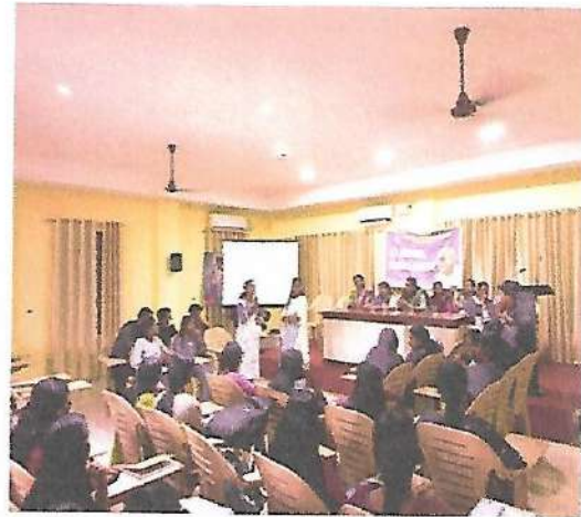
Debate competition conducted by ICDS