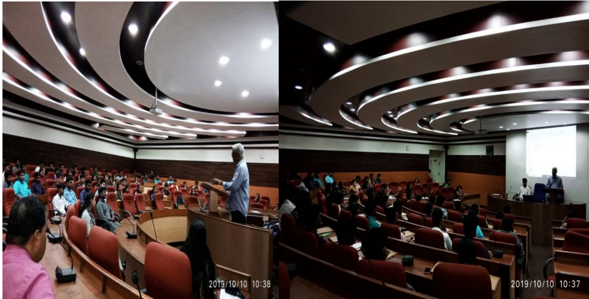
Residential session at the Kerala University student cell on Palliative care