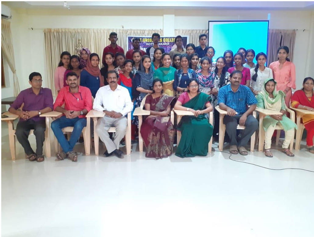
SGC Palliative Care Unit