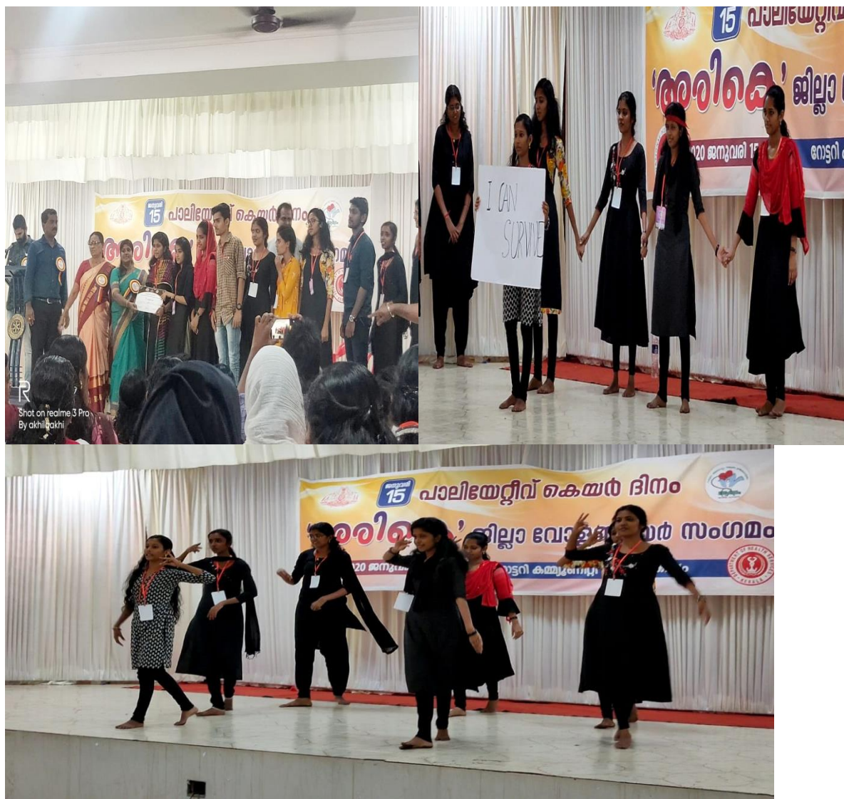
Functions held on January 15 at the Kollam town hall observing the Palliative care day

Nationally palliative care day is observed on January 15 th of every year, and the aim of observing resides on the fact of importance of Palliative care. The unit volunteers of the St. Gregorios College became a part of the palliative care day programs organized by the district Palliative care held at Kollam town hall. The events included certificate distribution of the student Palliative members who have undergone field training. The event was successful with the graceful presence of eminent personalities and Palliative care coordinators who have been serving the society under any circumstances.