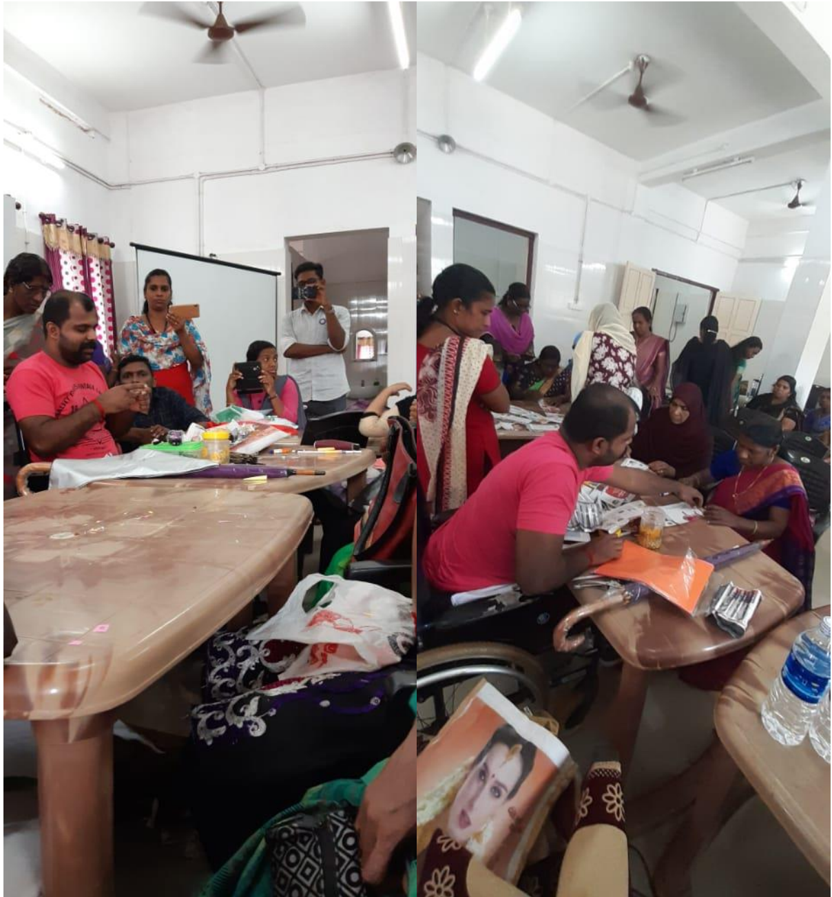
Active workshop on making of umbrellas at the conference Hall Thaluk Hospital, kottarakara